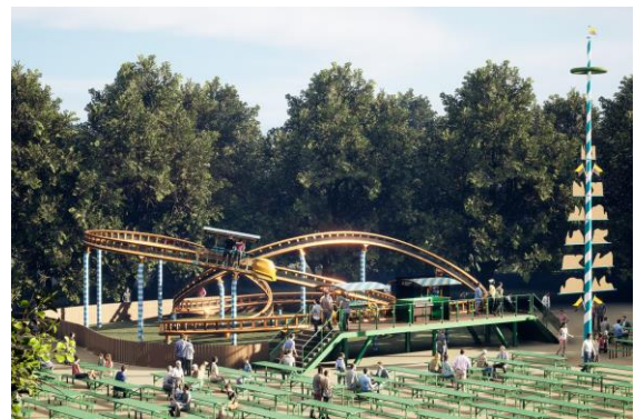
© Maurer Rides – Beer garden roller coaster