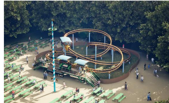
Beer garden roller coaster