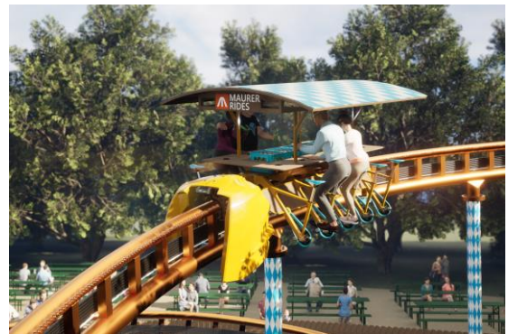
© Maurer Rides – Beer garden roller coaster