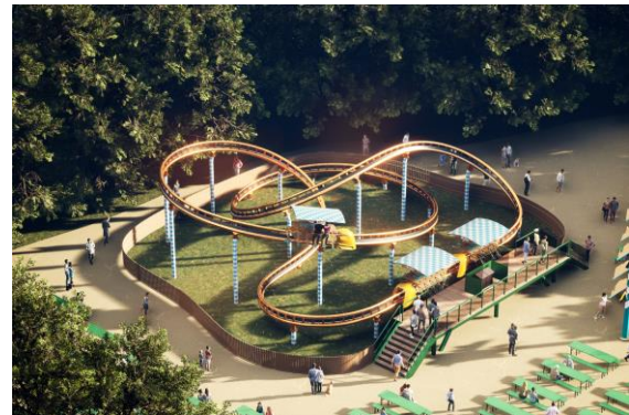
© Maurer Rides – Beer garden roller coaster